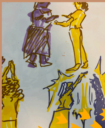
All artwork produced by a YAC Ambassador during the workshop, all credits to them.