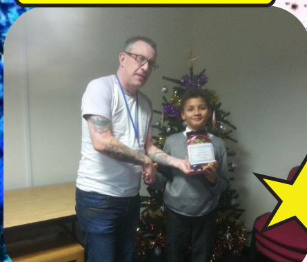
Tay Wins the Sweets!!