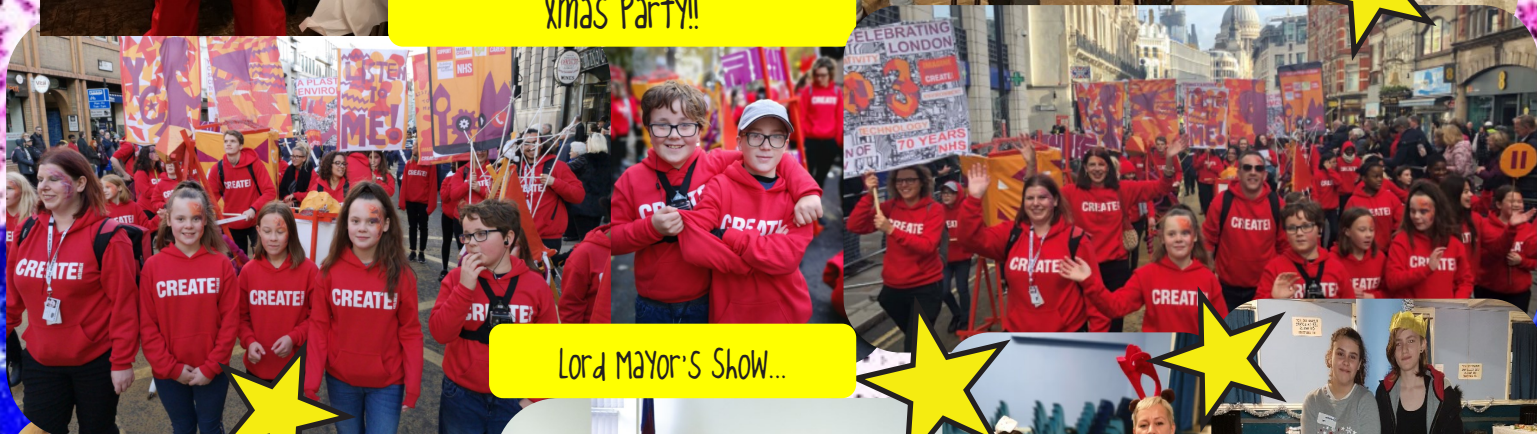
Lord Mayor's Show...