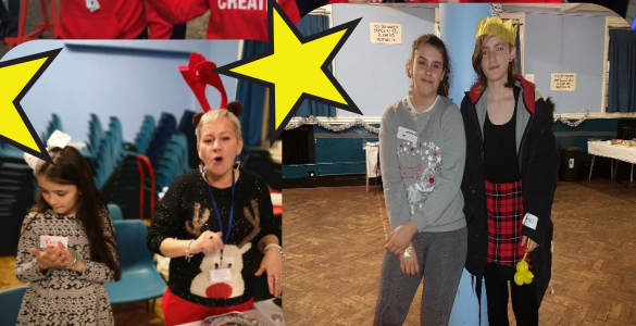
xmas Party and Meal