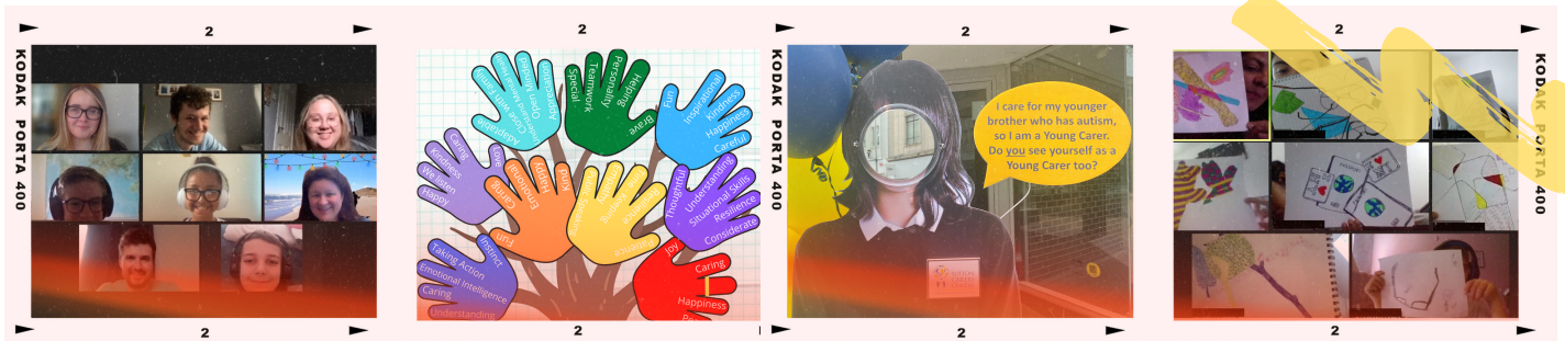
Images and highlights from our weekly sessions, holiday courses and Young Carers this summer.